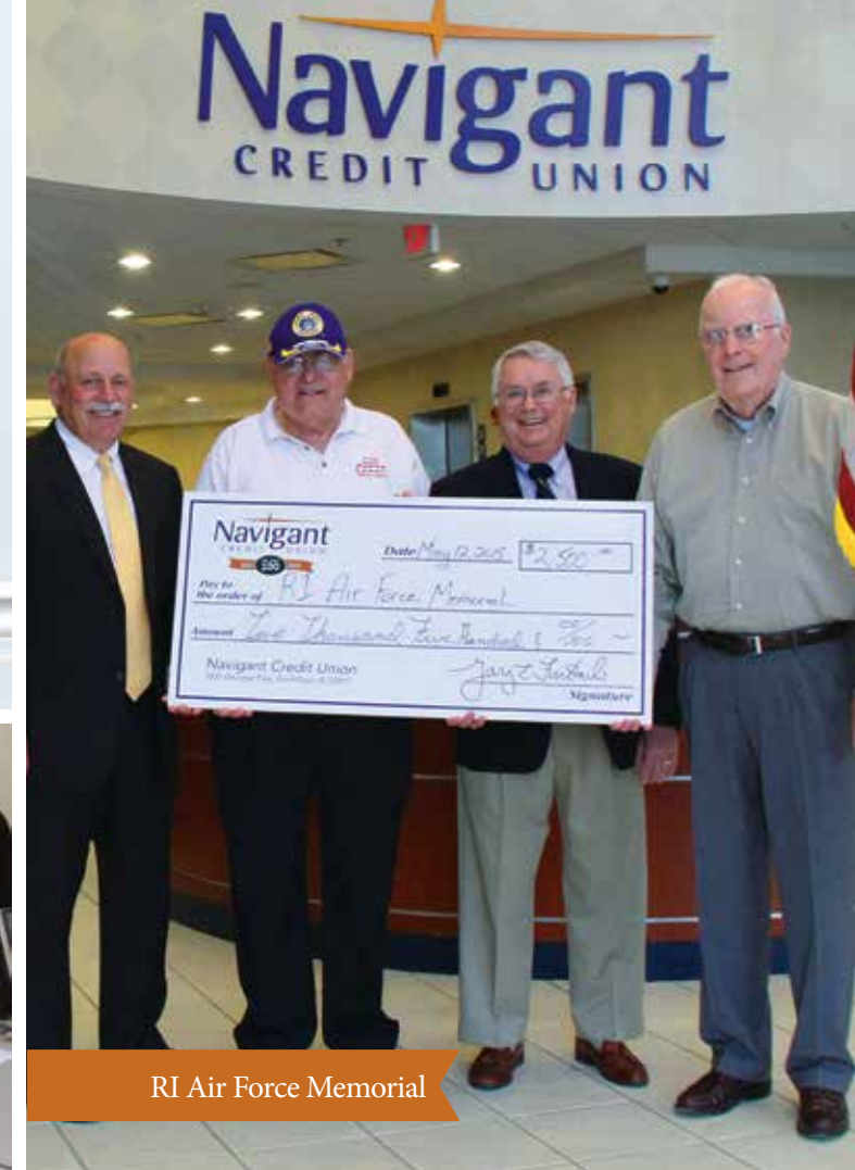
RI Air Force Memorial