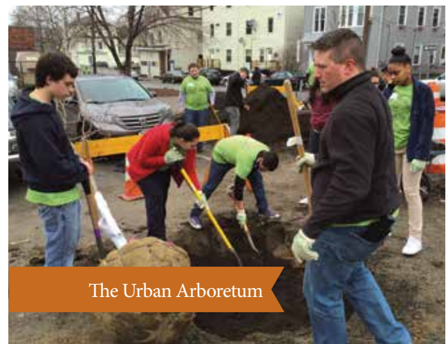
The Urban Arboretum