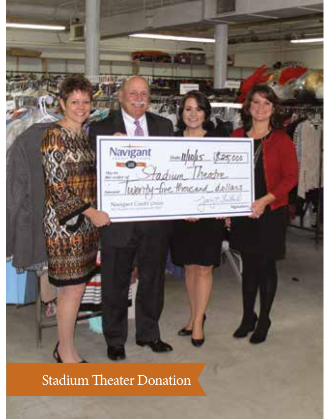
Stadium Theater Donation

In early March, we had the opportunity to bring all our employees together in one place to announce and kick-off our year-long celebration of the Credit Union's 100th anniversary.