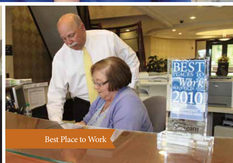
Best Place to Work