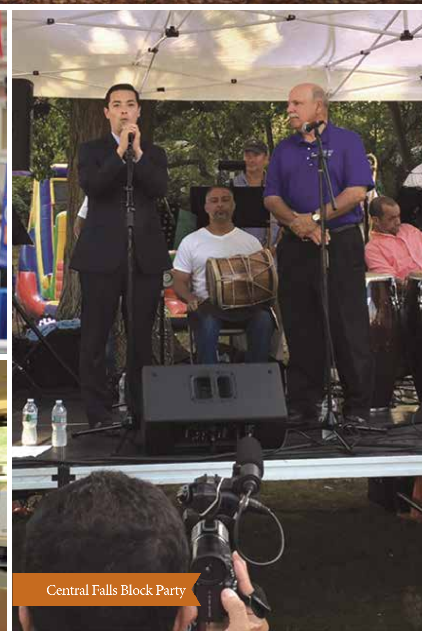
Central Falls Block Party