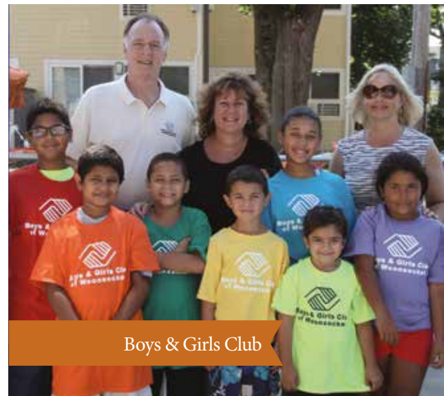
Boys & Girls Club