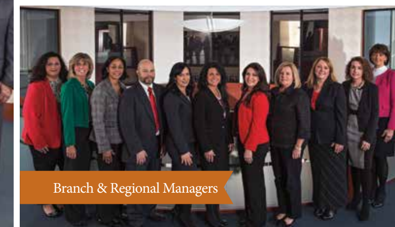
Branch & Regional Managers