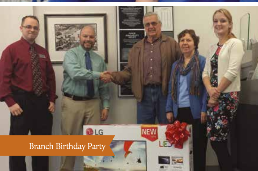
Branch Birthday Party